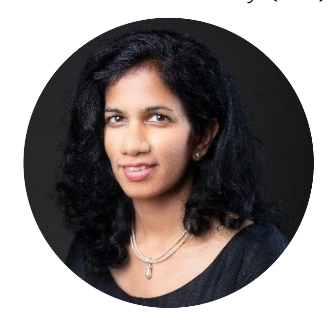
Abstract Title: Importance of Data – sources and accuracy